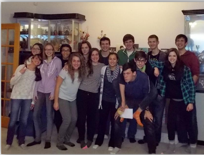
On January 30, 2015 some of the past FBBC staff got together for an evening of fellowship, fun and food.

Prayer Requests: "Pray for the camper mentioned above, that there would be another Christian to come alongside him and help him grow. Pray for me as I learn more, to prepare me to bring more people to Christ."